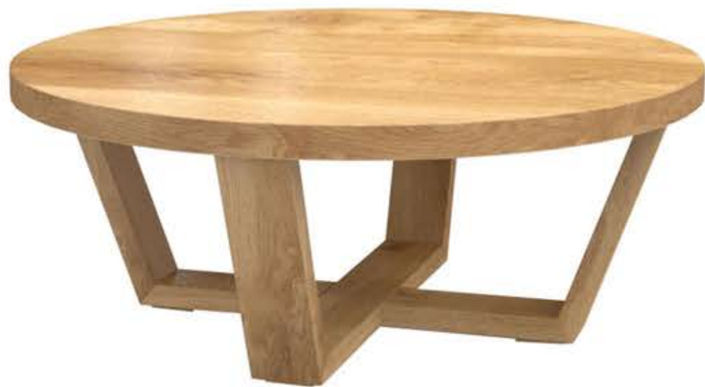
table orlean 100